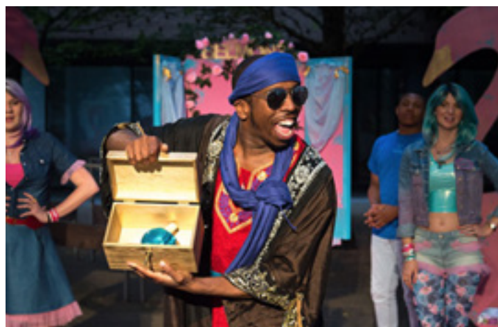
Studio 3 Arts

Our aim is to encourage experimentation and ambition in the cultural output of the Borough, but this must be underpinned by robust evaluation to ensure excellence in everything we do.