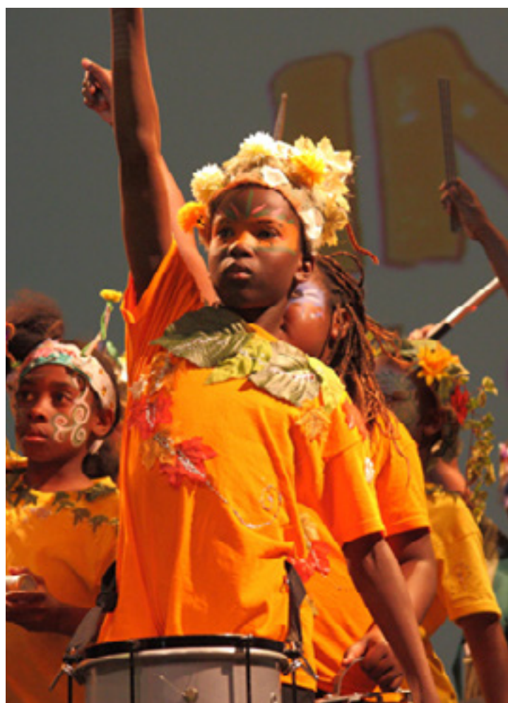
Cultural Education Partnership

All communities create and invest in culture and one of the indicators of a healthy, confident community is a visible and dynamic cultural sphere. This strategy advocates that our definition of culture should be as broad as possible enabling people of all ages and backgrounds to value their cultural interests.