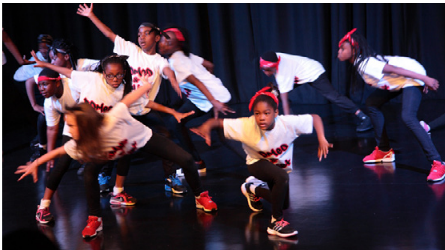
Cultural Education Partnership

The time is right for Barking and Dagenham to make a commitment to the role of culture in every aspect of life in the Borough. The 2013 – 16 Arts Strategy set out the benefits of art and cultural opportunities for residents and established new infrastructures for the governance of culture - we now need to build on this.