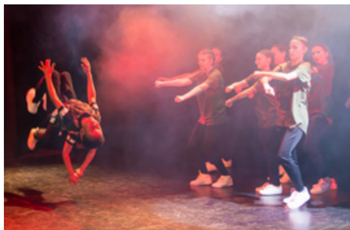
Barking and Dagenham Youth Dance

We need a new more ambitious approach for communicating the cultural offer to people living in the Borough and beyond. We need an agile multi-platform approach for sharing opportunities and co-producing content that communicates to younger and older audiences and people with a range of skills and expectations.