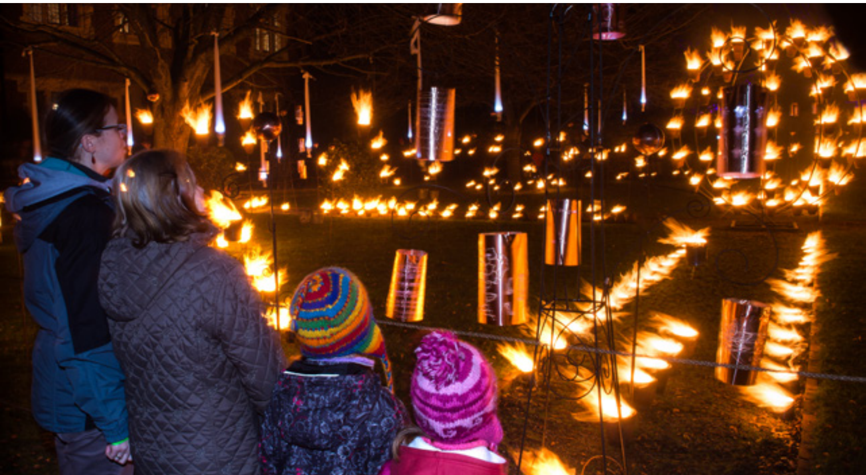
GLOW ©Mark Sepple