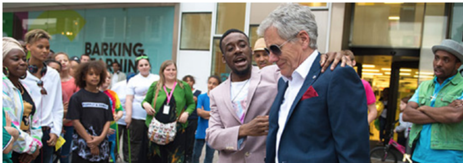
Studio 3 Arts

School of Music and Drama, the British Film Institute and The Royal Shakespeare Company. Alongside this it is crucial that the Culture Strategy and Commissioning Manager establishes new relationships with new strategic partners whose expertise could support, amongst other things, evaluation, programme delivery, research, education, peer-to-peer learning and future planning. This is an indicative list of potential strategic links going forward: