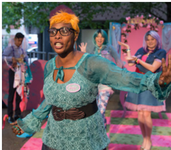
Studio 3 Arts

This new strategy places emphasis on cutting across sectors, services and organisational divisions to support a more coherent infrastructure with the ultimate goal to enable more ambitious and far-reaching programming.