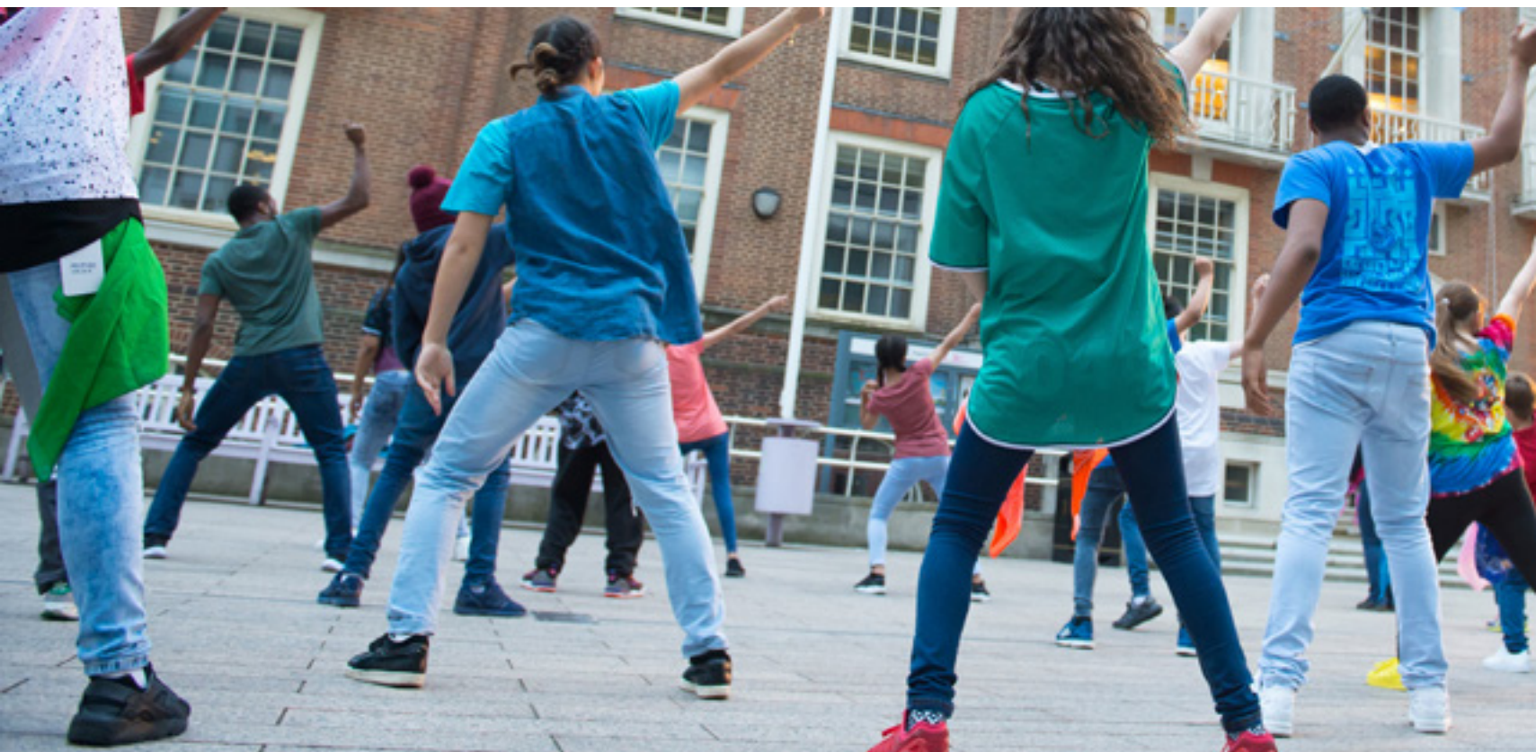
Studio 3 Arts