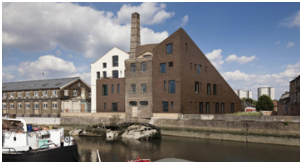
The Ice House Quarter

The remarkable narrative of the London Borough of Barking and Dagenham is different to that of any other London Borough. It is an incredible story of social ambition, political strength, rapid transition from rural to urban, sporting victory, women's rights, the industrial powerbase for London, visionary housing and the success of migrant communities.